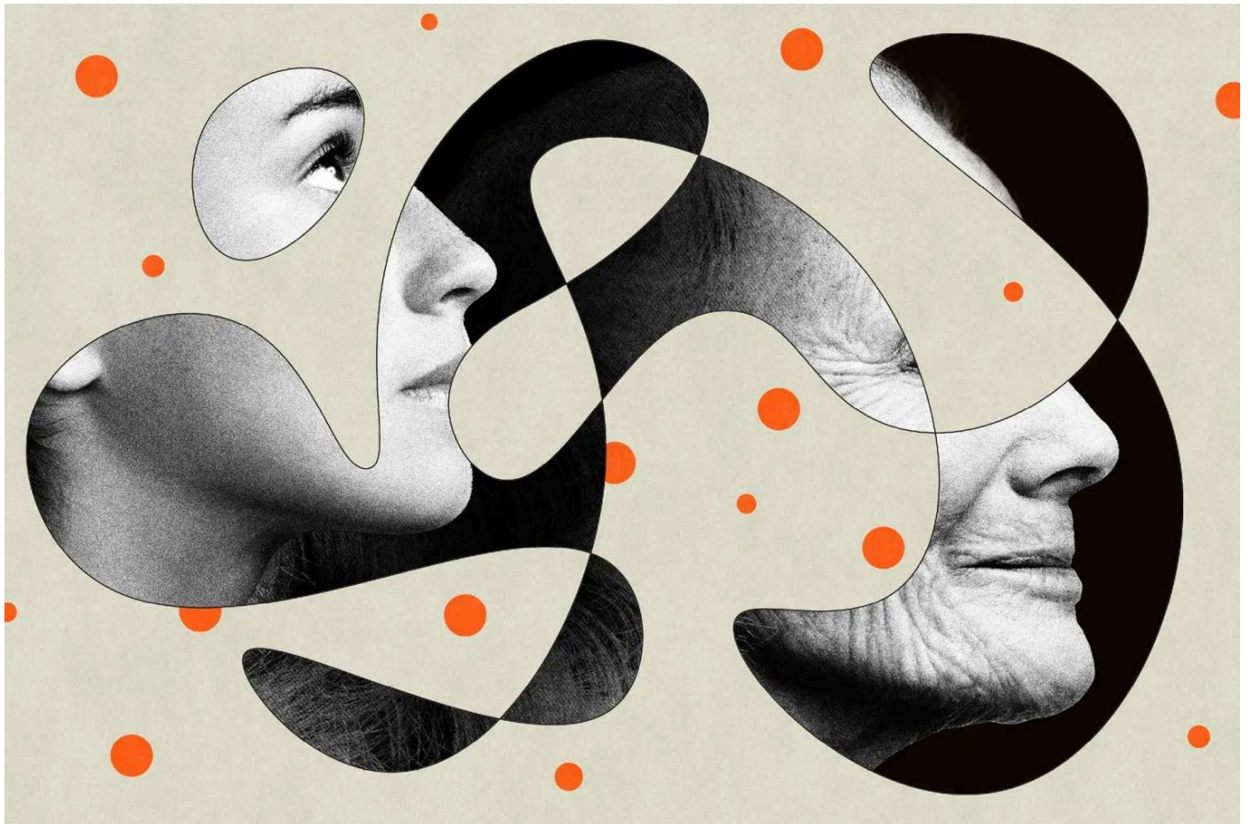
Illustration by Joan Wong for Time