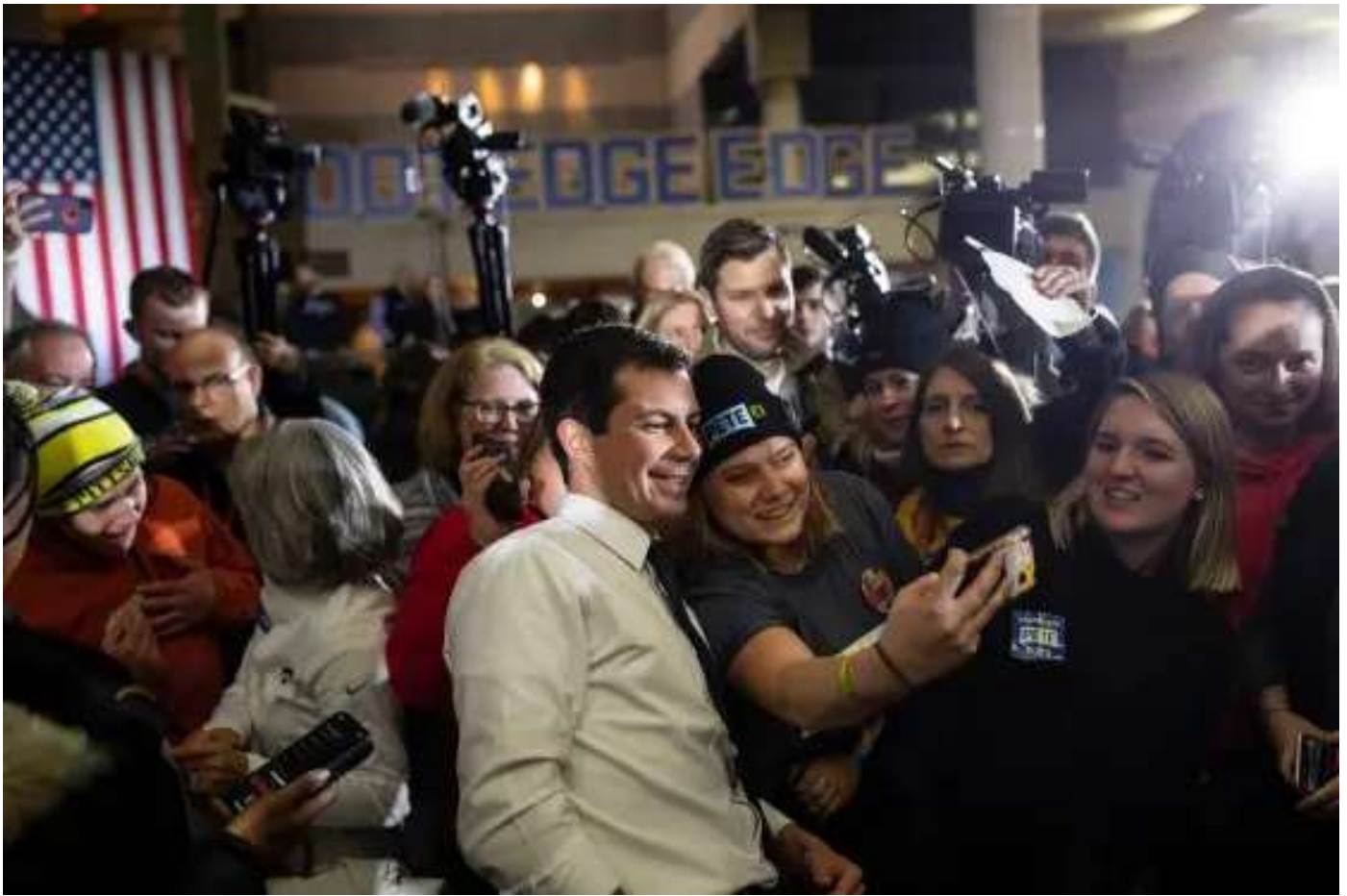
Former South Bend mayor Buttigieg with supporters at a campaign event in Des Moines, Iowa

On Christmas Eve 1999 , 16-year-old Haley Stevens opened her journal, gripped a purple marker and wrote: Haley’s Millennium Ideas. Her letters were large and looping. “The polar ice caps are going to melt,” she wrote. “Natural disasters and mad leaders at war ... what we read and what we do became so unbalanced and money driven.” Like most diary-scribbling teenagers, she had a flair for the dramatic: “We won’t stop our mistakes,” she wrote. “So what the prophets predict will come true.”