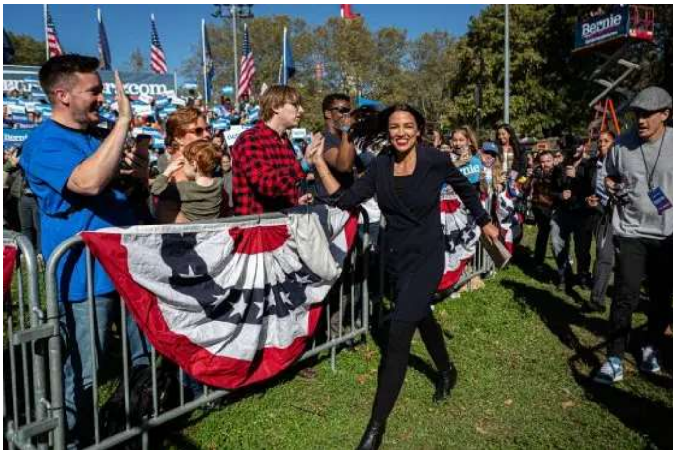
Ocasio-Cortez rallies fellow millennials at a Sanders campaign event in Queens, N.Y., on Oct. 19

These generational rifts have already defined the Democratic primary in surprising ways. Buttigieg has frequently noted that he is a member of the “school-shooting generation,” and emphasized that millennials like him will be on “the business end” of climate change. When I first met Buttigieg at a coffee shop in Manhattan in 2017, he told me he thought a lot about the 2004 commencement speech that the comedian Jon Stewart gave at William & Mary. “He said, ‘Here’s the thing about the real world: We broke it, sorry’—I think he meant grownups,” Buttigieg told me, paraphrasing the speech. “He said, ‘We broke it, but the thing is, if you figure out how to fix it, you get to be the next Greatest Generation.’”