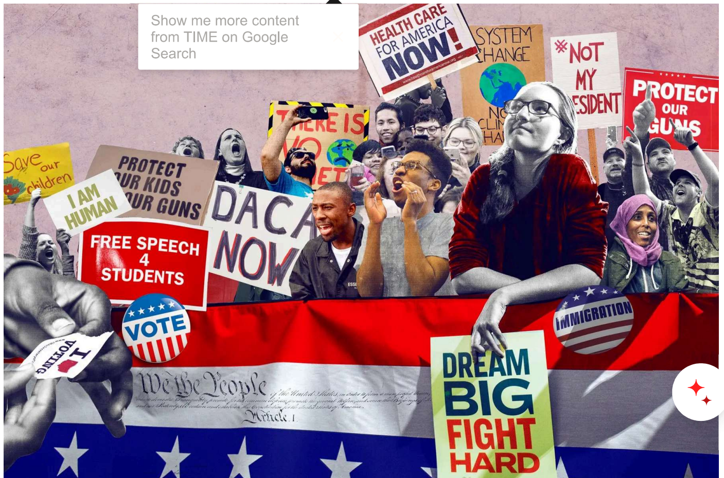
Illustration by Michelle Thompson for TIME

Show me more content from TIME on Google Search