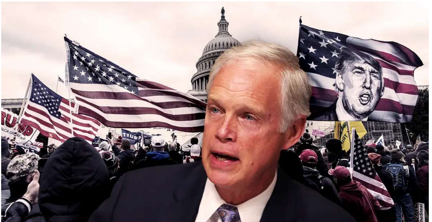
Ron Johnson | Capitol Riots

By HEATHER DIGBY PARTON PUBLISHED FEBRUARY 4, 2022 10:23AM (EST)